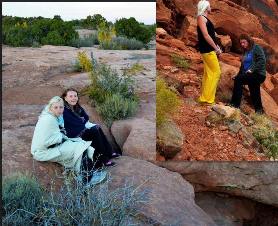
Jug –Handle Arch