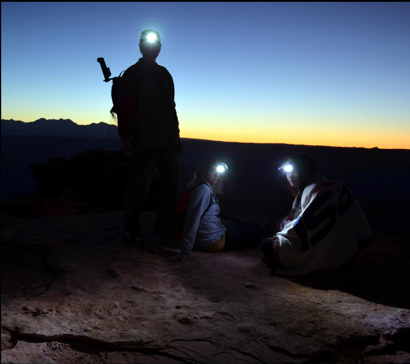
Sunrise at the White Rim Overlook – Canyonlands National Park