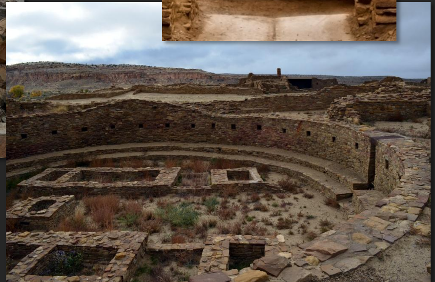
Chaco Culture National Historic Park NM