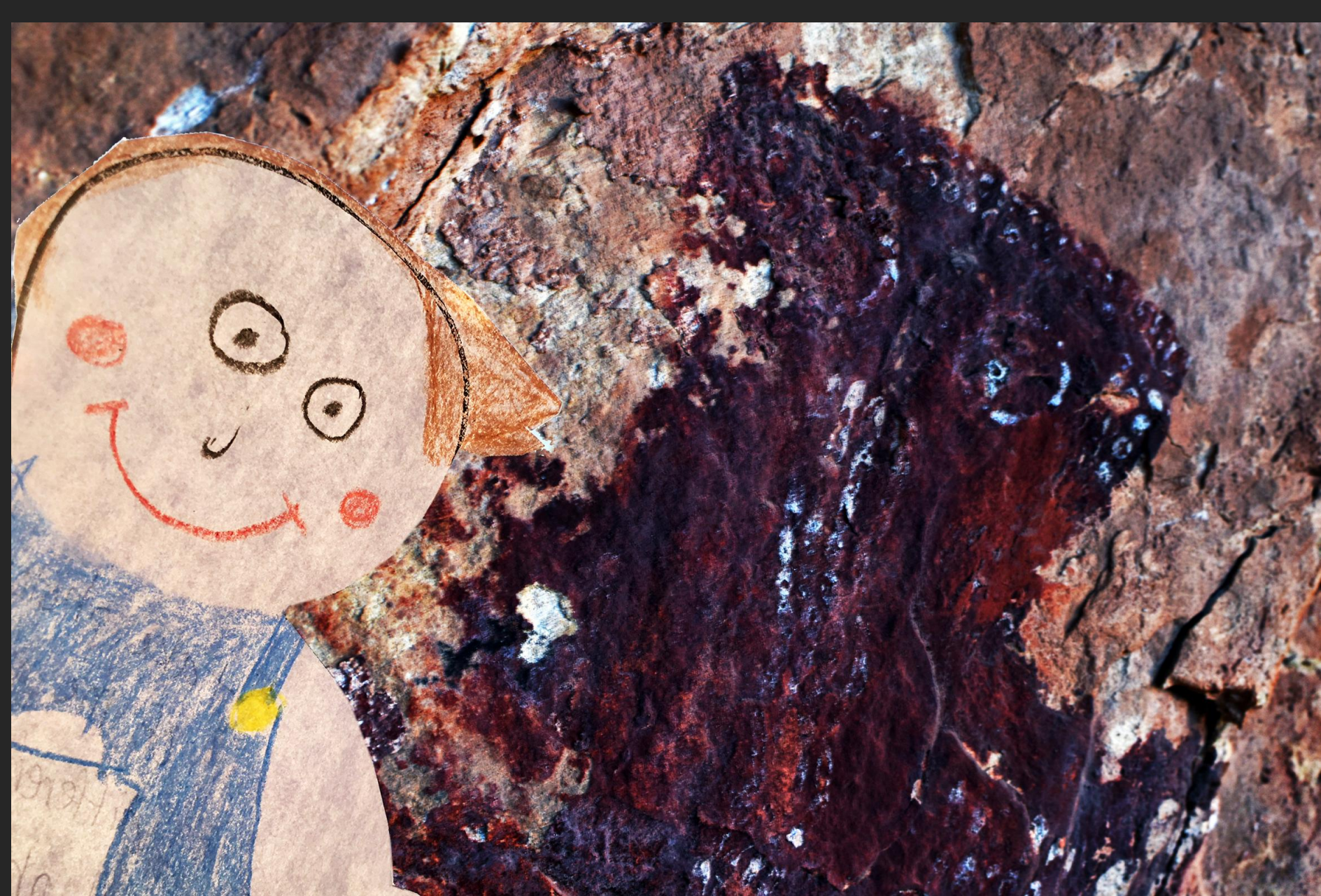
FLAT STANLEY AND ANCESTOR