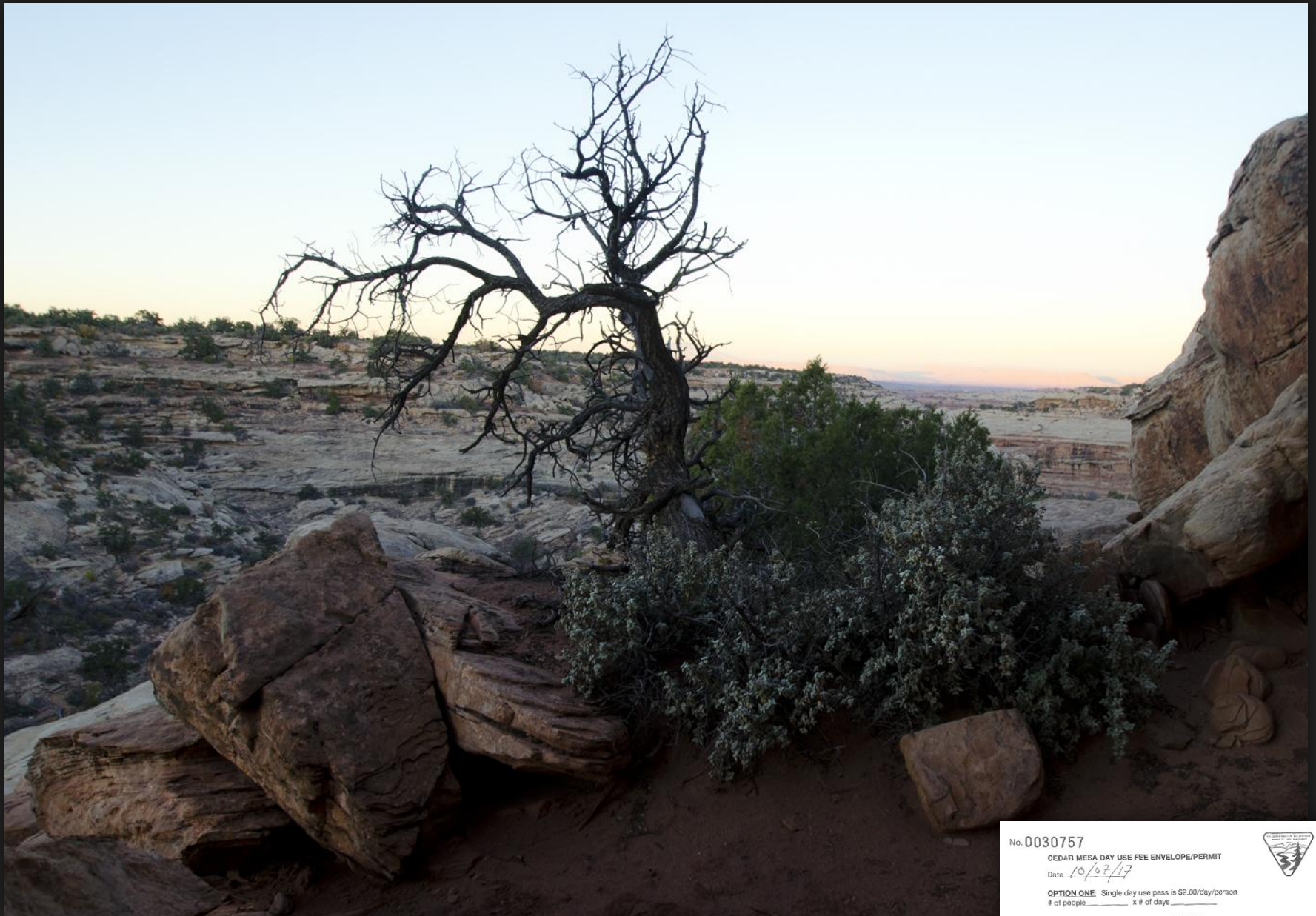
In Slickhorn Canyon near first ruins at sunrise